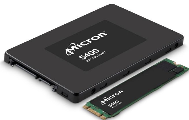
Micron 5400 SSD

The Micron 5400 offers reliability (MTTF) and endurance ratings that are 50% higher than the other leading data center SATA SSD — all backed by Micron's standard 5-year data center SSD warranty. 8