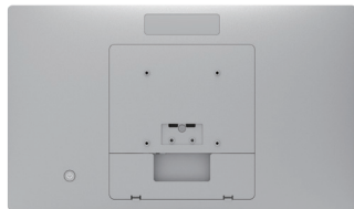
Supports wall and VESA mounting