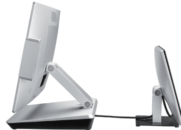
Integrate devices via USB-C