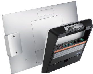
Connect hub to stand, supports separate operation