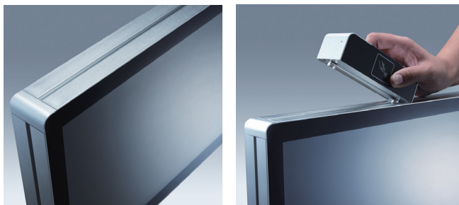
Side groove design for Flexible peripheral device