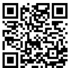
F110 3D demo